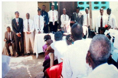
CBT Students lead a seminar in Thomassique

The students at the Center for Biblical Training have a break month after every 3 months of classes to give them the opportunity to go home to their families and churches. The first week of this break, the students “give back” some of the blessings of Bible education they have been given as they go travel out to teach seminars in village churches.