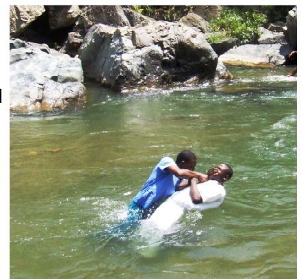
Baptism in Peltan after gospel meeting

We will never solve all the daily physical tragedies going on in Haiti. But spiritual poverty and slavery to Satan is a tragedy that we can and are doing something about. We need to keep our focus on those spiritual tragedies and victories, and continue to work with eternity in mind.