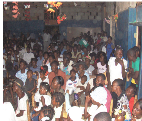
Gospel Meeting in Peltan