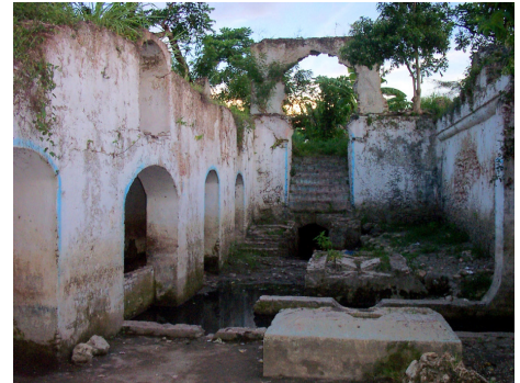
Voodoo temple Lovana behind the CBT

And every day hundreds die after living an average of only 50 years, and they find out just how badly they have been deceived.