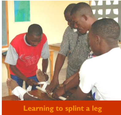
Learning to splint a leg

admitted that they were apprehensive about living with strange men from faraway areas of the country. But as they grew spiritually and socially, they grew together.